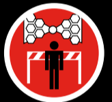
Major Accident Hazard Understanding