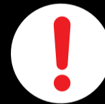
Alerts & Moments